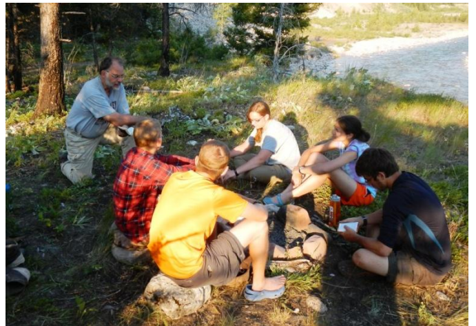
Evening devotions – studying the book of Philippians

the new life we can have because of what our Lord Jesus Christ has done for us! So join us if you dare! You will see beauty few have ever seen!