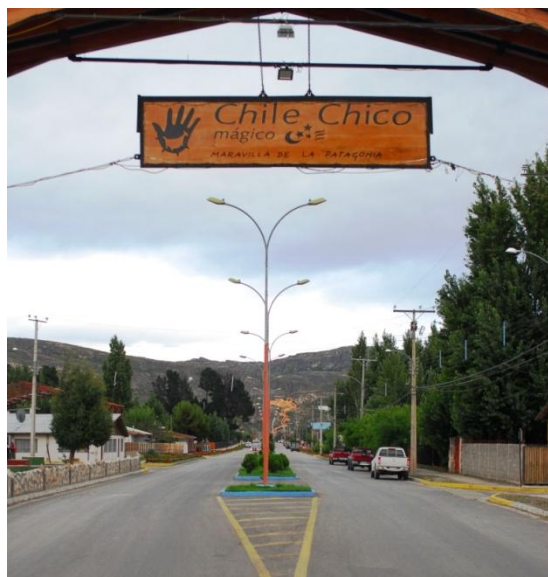
The name says it all