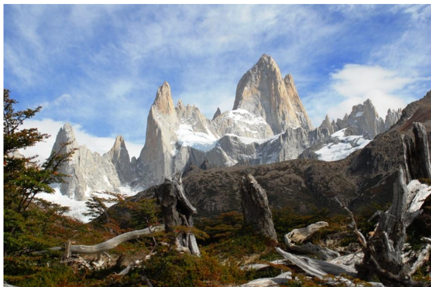
Mt. Fitz Roy, in Argentina