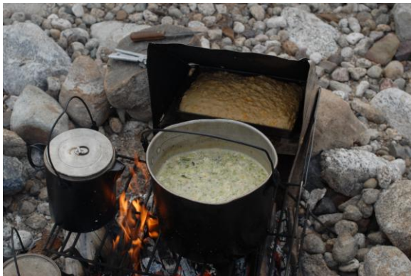
Mmmm...hot garlic-cheese biscuits

Our final trip of 2010 was a mission trip to "Asia" serving with the Taylor's.