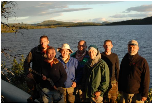
August in Labrador