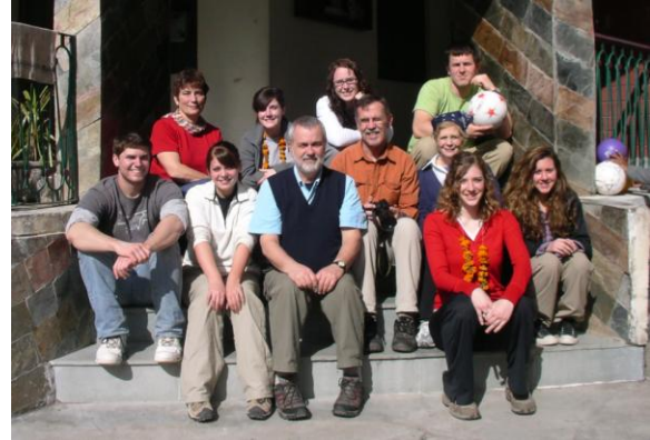
Group shot at the Children's Home